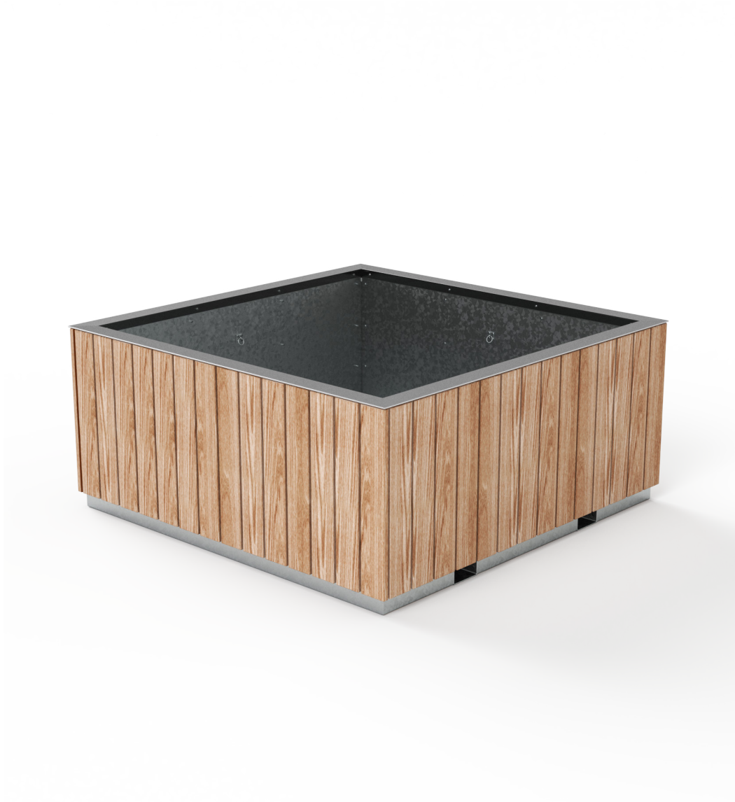
Tree Planter (2.0m)