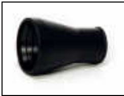
Cone 1 - std. cone special cone

Different cone shapes are available, depending on the application.