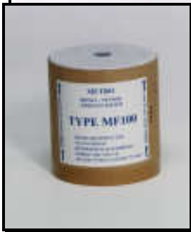
Replacement filter. Used filters are disposable as normal industrial waste.