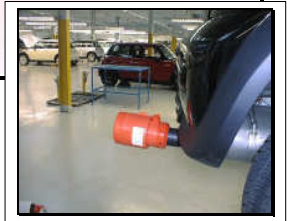
MF100 filter in use at a car assembly plant.

A compact, highly effective and versatile exhaust filter unit designed for use on vehicles being started or moved within an enclosed environment.