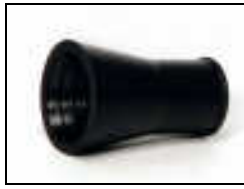
Cone 2 - short cone