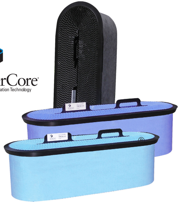
PowerCore® CP Filter Pack

PowerCore A Donaldson Filtration Technology