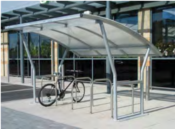
▲ ACADEMY Cycle Shelter galvanised finish with polycarbonate roof installed at Foss Island Business Park, York shown with five COLLEGE stainless steel cycle stands (see page 86-88)

Furnitubes range of Academy free-standing covered shelter units are an ideal way to encourage cycle use. The contemporary heavy duty steel frame is extremely strong and galvanised for long-term protection against the elements.