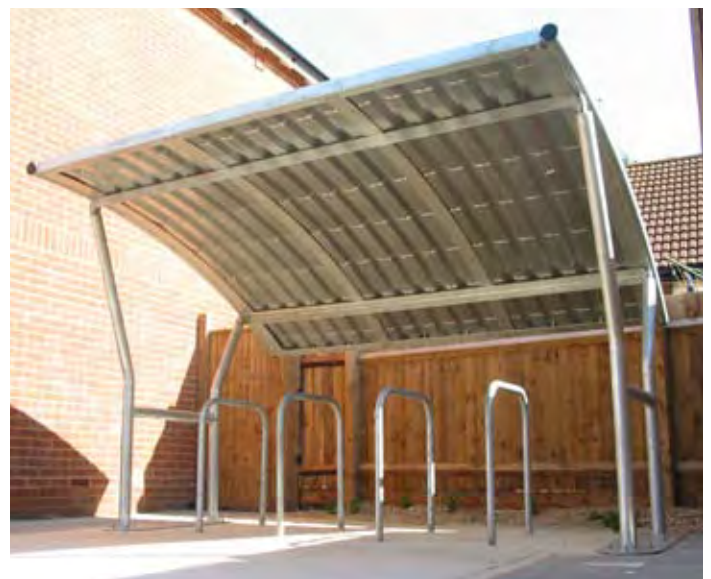
▲ ACADEMY Cycle Shelter shown here at Silver End Road, Haynes corrugated steel roof, galvanised finish shown with four COLLEGE galvanised steel cycle stands (see pages 86-88)