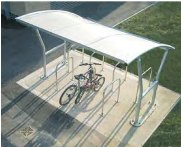
▲ ACADEMY Cycle Shelter supplied to King Egbert School, Sheffield galvanised finish with polycarbonate roof shown with seven COLLEGE stainless steel cycle stands (see page 86-88)

The durable corrugated roof is available either galvanised or galvanised and plastisol colour coated. A 10mm dual-walled clear polycarbonate roof is also available as an attractive modern option.