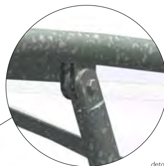
detail ROOF PURLIN SUPPORT BRACKET

SUBSTANTIAL Ø76 MILD STEEL GALVANISED FRAME CONSTRUCTION