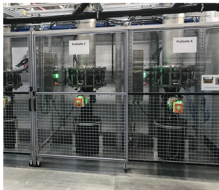
To ensure the high quality standard, the butterfly valves are tested under the toughest conditions in a test stand.

The Butterfly Valve 565 is produced by GF Piping Systems in Seewis (Grisons), Switzerland. High-quality valves have been produced here for over half a century. They combine technological innovation with the highest standards of material selection, manufacturing and quality testing for safety, durability and reliability.