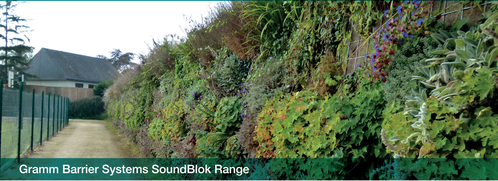
Gramm Barrier Systems SoundBlok Range