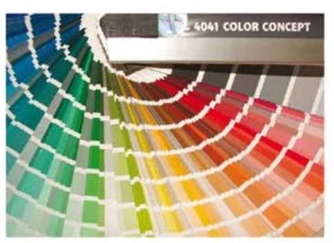
Please note: Colours are reproduced as accurately as possible within the limitations of the print process but may be subject to variation.

Alternatively, use one of the 1200 available shades of opaque coloured woodstain to create effects ranging from classic heritage colours, (left) to vibrant modern effects. The colours illustrated opposite represent a small fraction of what is available. For further information, please contact us.