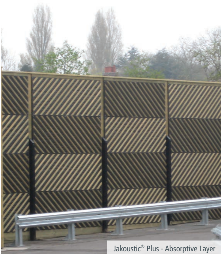
Jakoustic® Plus - Absorptive Layer