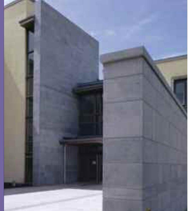
Marine Institute, Galway

Working closely with the design teams in question, Hardscape have created many bespoke and highly unique complementary elements to schemes.