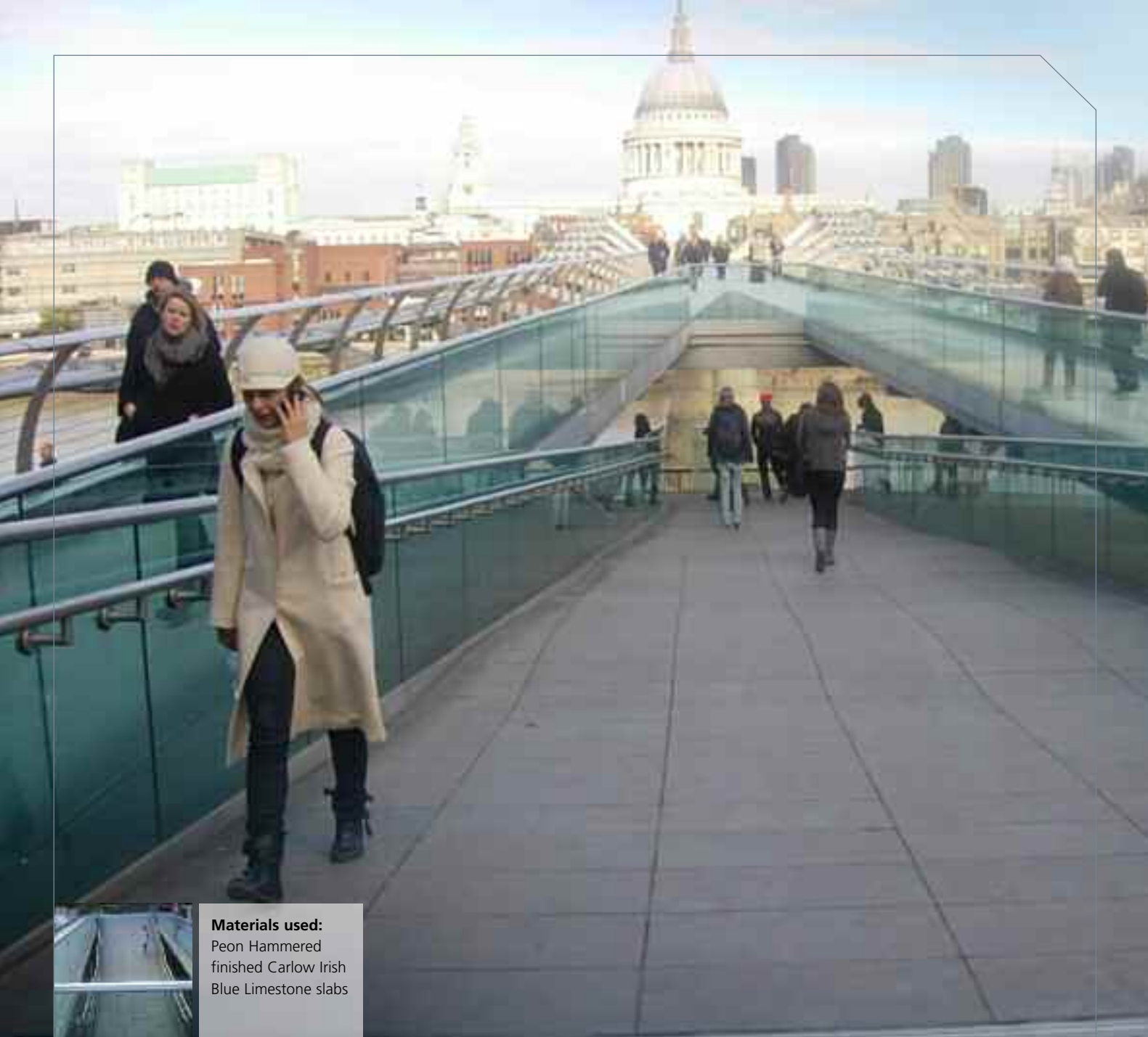
The Millennium Bridge, London

Materials used: Peon Hammered finished Carlow Irish Blue Limestone slabs