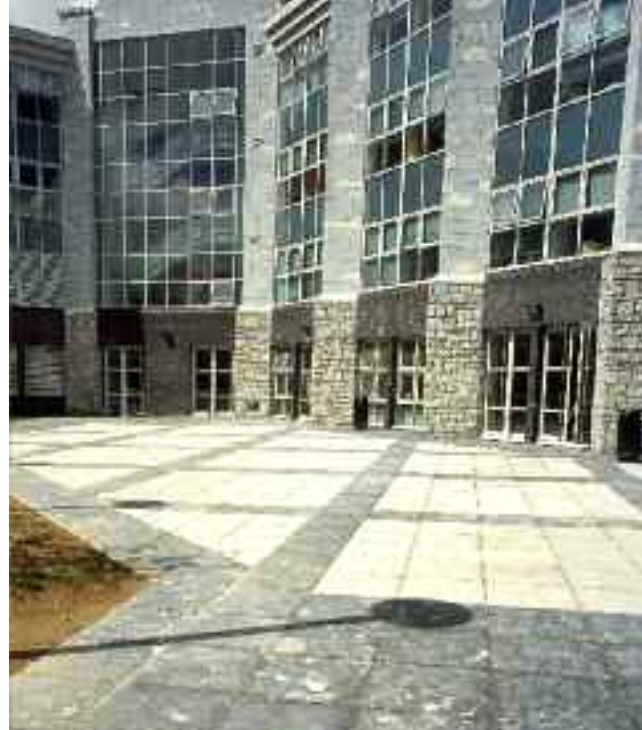
University College, Cork