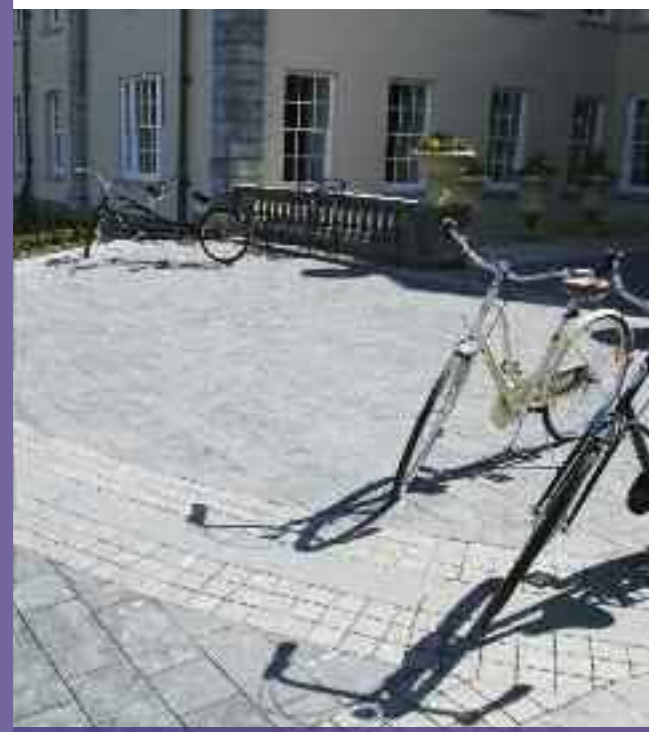
Castlemartyr House Hotel, Cork