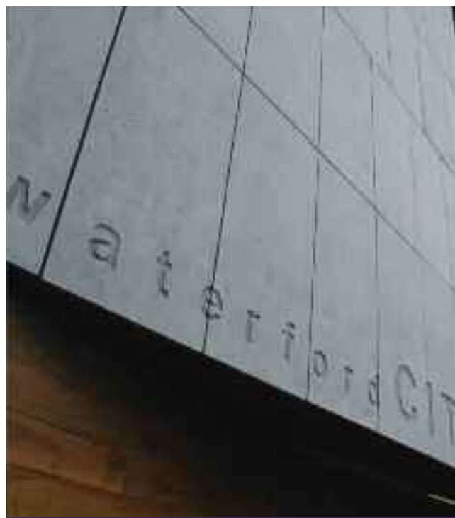
The Library, Waterford