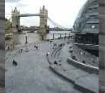
More Project, London Flamed finish Carlow Irish Blue Limestone