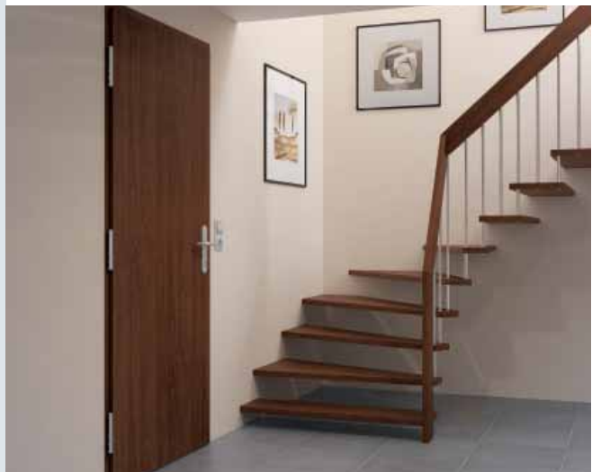
The KSI Thermo offers the best thermal insulation and WK 2 security equipment as standard