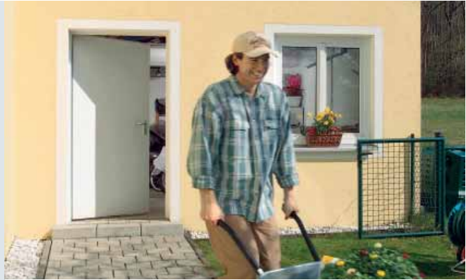
Perfect for outbuildings, utility sheds or storage rooms: the MZ multi-purpose door

Inexpensive and sturdy ZK internal doors are set apart by many advantageous features and can be used from the basement up to the loft. They are durable, resistant to stains, light and close quietly. They also come in almost any colour and are ideal for modernising your home.