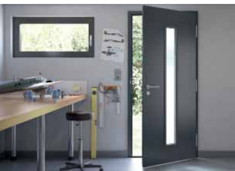
External doors with thermal breaks Security doors and multi-purpose doors with up to 30% better thermal insulation