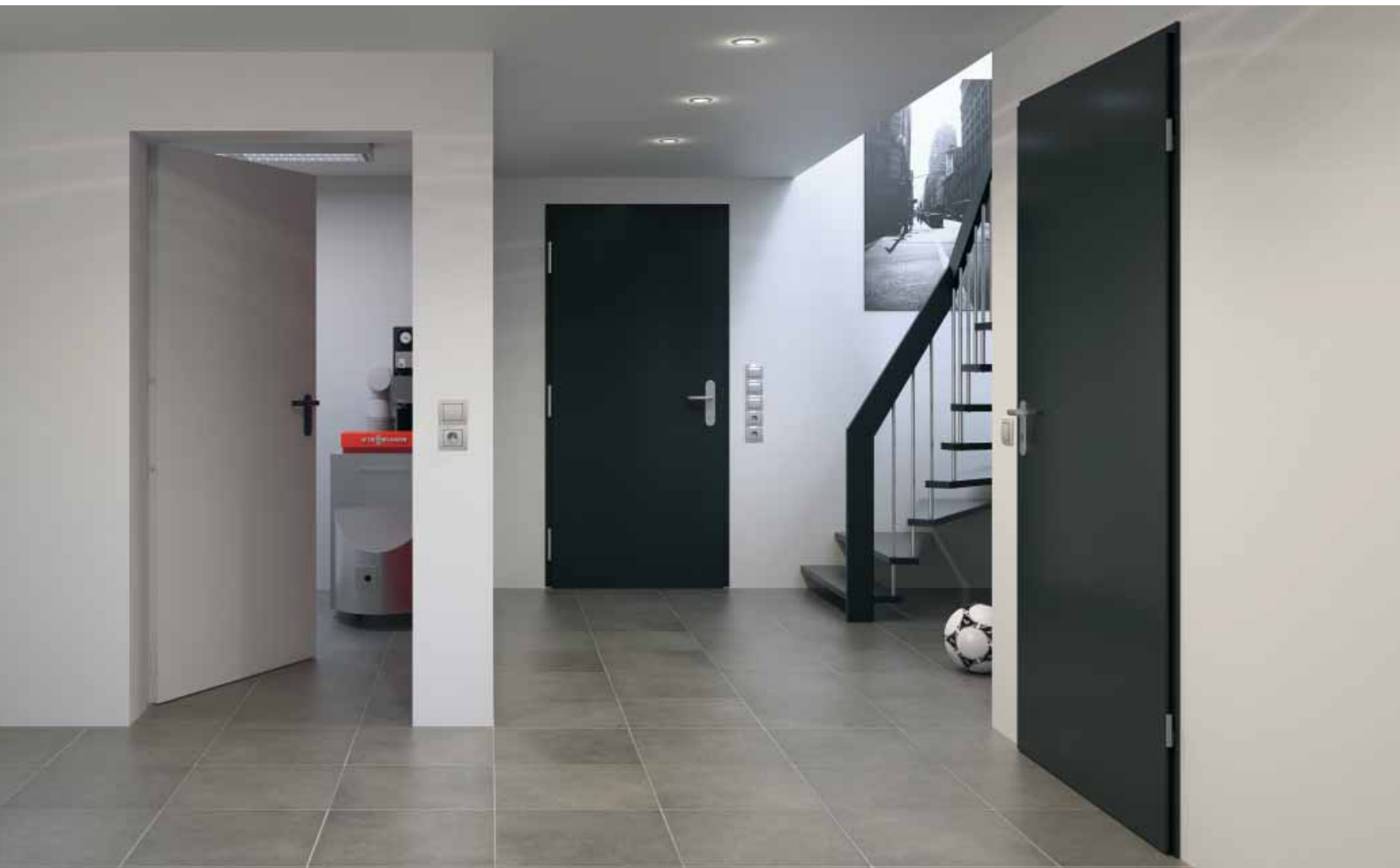
Shown above (from left): H8-5 fire-rated door in Grey white (similar to RAL 9002), KSI Thermo external security door in Anthracite (similar to RAL 7016), ZK internal door in Anthracite (similar to RAL 7016).