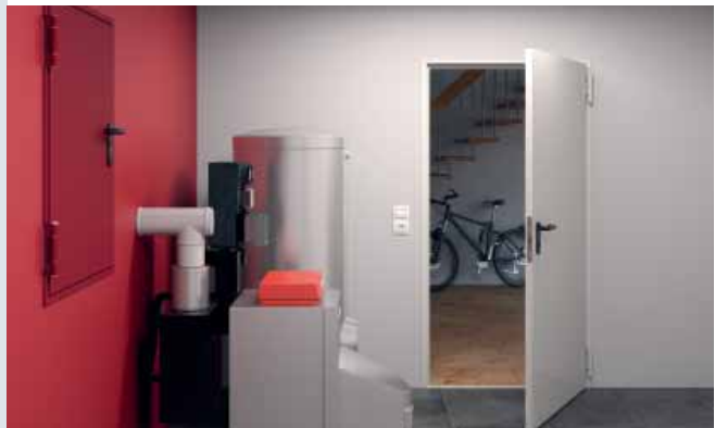
Europe's most popular boiler room door: the H8-5 fire-rated door