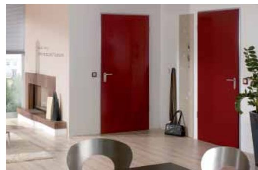
Numerous colours 12 preferred colours and 6 decor surfaces offer a wide variety of design options.