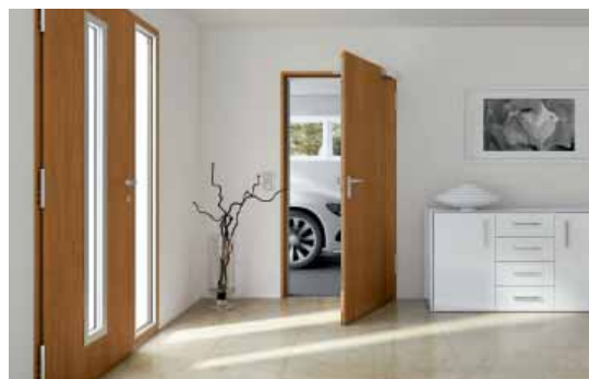
Sturdy internal doors Fire-rated doors, security doors and internal doors that blend in perfectly with the doors in your home.