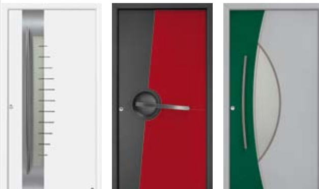
Style examples from the aluminium entrance door range: 559 TC/TP in White, 595 TP in CH 703 and colour embellishments in Ruby red, 589 TP in White aluminium and colour embellishments in Moss green

Hörmann aluminium entrance doors are available in the following series: Comfort, TopComfort, TopPrestige and TopPrestigePlus. The doors have the best possible thermal insulation thanks to an aluminium profile system with thermal break, come with extensive security equipment, are acoustic-rated and are sturdy for many years to come. The range of doors is extended by our ThermoPro entrance doors. A beautiful appearance without a visible leaf frame and excellent thermal insulation make these steel entrance doors an inexpensive alternative with the same high Hörmann quality.