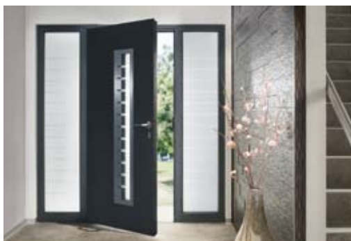
Hörmann entrance doors are also attractive on the inside thanks to well thought-out equipment and excellent quality.