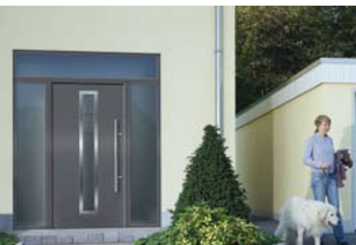
ThermoPro steel entrance doors are a beautiful way of presenting your home.