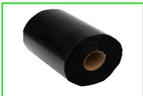
Root Barrier C3 Lapping Tape