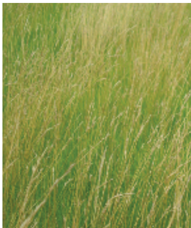
LT2 when left to grow long

“We have left the LT2 to grow long and it has worked really well. We are really pleased with it. It has blended well with the rough and is not too thick in the bottom – ideal for finding the ball.”