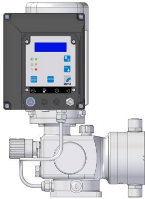
Controllable diaphragm pump, type C 409.2