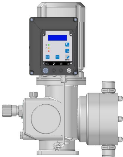
Controllable diaphragm pump, type C 410.2 (0,37 kW)