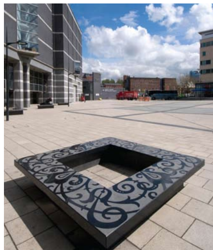
Bespoke Black Granite Seating, Perfecta Paving