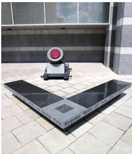
Bespoke Black Granite Seating, Perfecta Paving