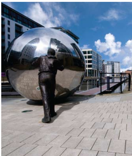
Perfecta Concrete Paving

It was a testament to the high quality of the development and partnership working with the client, contractor and consulting engineers Buro Happold Leeds and Sanderson Associates that the project won the 'Built in Quality' award in the 'New Build' category at the West Yorkshire Built in Quality Awards which recognises and rewards good quality building practices across a wide range of categories.