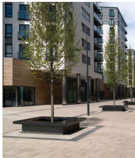
Bespoke Black Granite Seating & Planters, Perfecta Paving