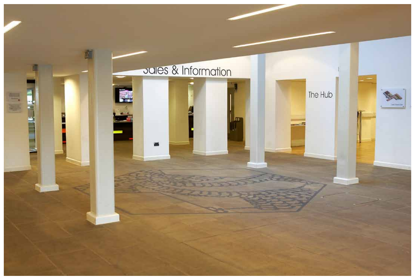
Cromwell Diamond Sawn Yorkstone