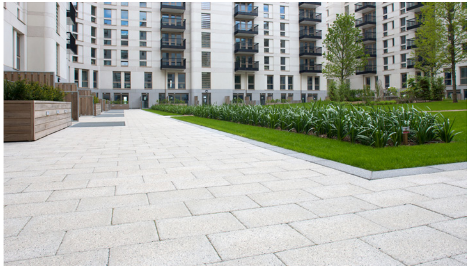
Conservation paving within an apartment block garden