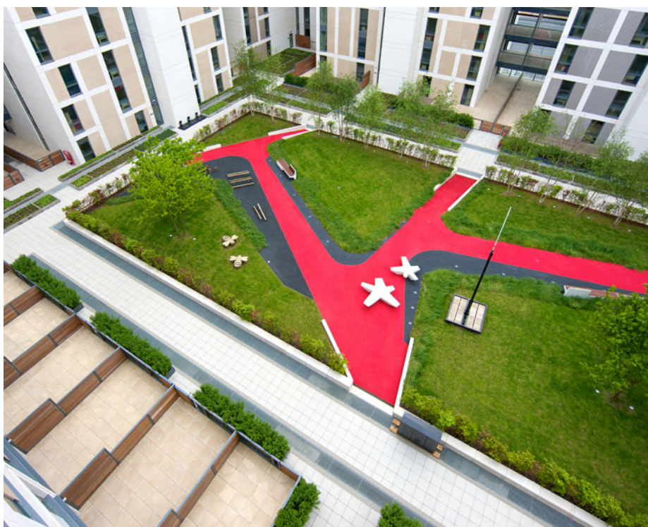
A bird's eye view of an apartment block garden featuring Marshalls paving and street furniture