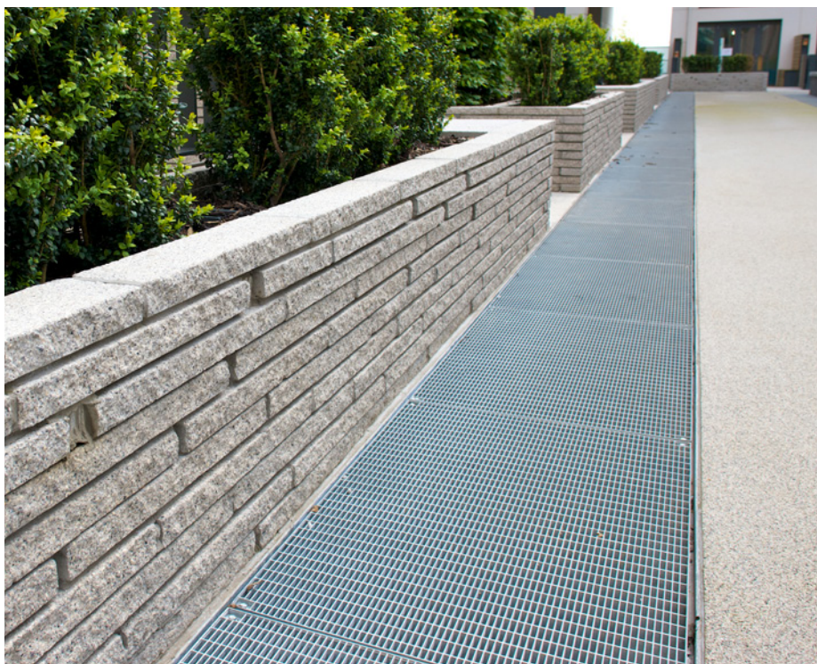
Argent coping used as walling in an apartment block garden

Client: ODA Landscape Architects: Applied Landscape Design Engineer: Arup Contractor: Lend Lease Products: Products from 51 separate product ranges supplied