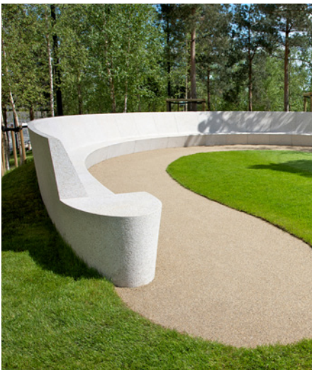
Bespoke 100 tonne granite bench, a key focal point of the public realm space

"Sourcing a wide range of products from Marshalls has also meant a greater consistency of finish, and this can only be achieved by working with a supplier who has a wide palette of products, the result is a fantastic flow in the hard landscaped areas.