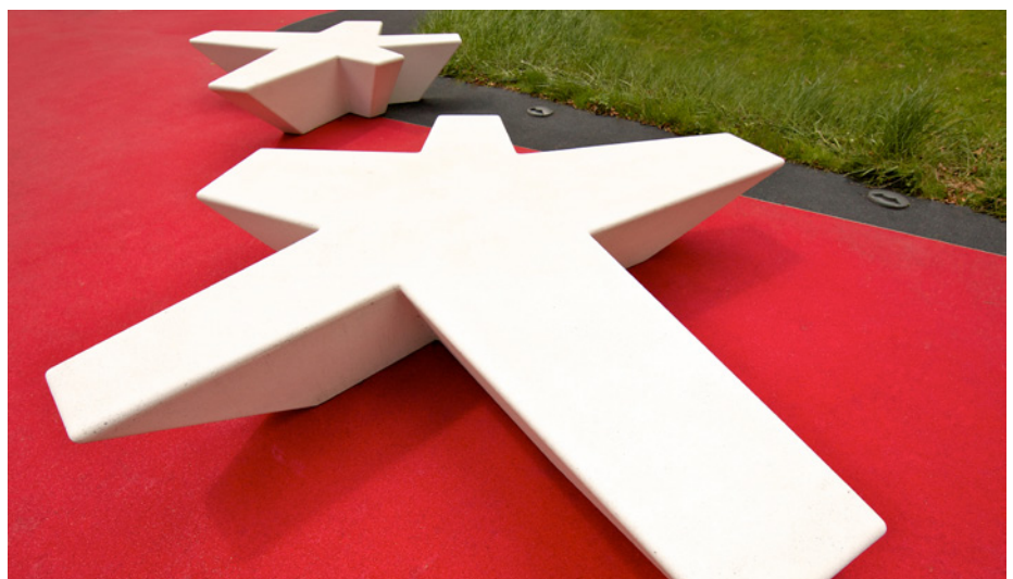
Woodhouse escofet bench.