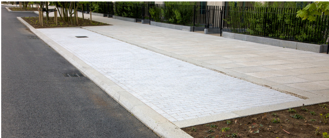
A loading bay featuring Marshalls granite setts and a Conservation silver grey kerb with special profile for ease of vehicular access