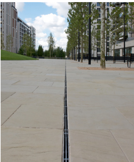
Linear Drainage Channel