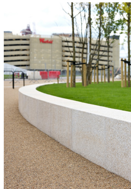
Marshalls bespoke curved granite wall