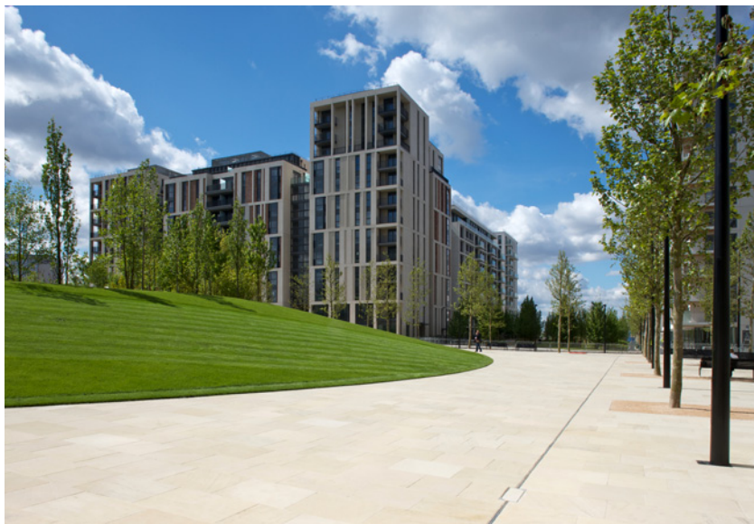
Cromwell Yorkstone and Birco linear drainage, East Village public realm, Stratford, East London