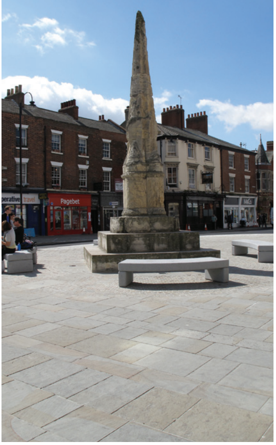
Greenmoor Rustic paving, Selby Market Cross