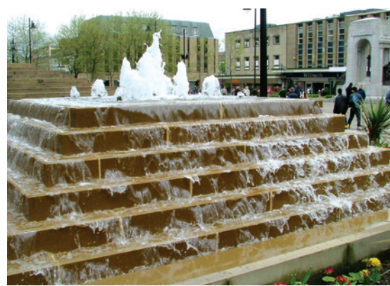
Cromwell water feature, Bolton

Lead times may vary throughout the year so please check the availability of all items with our Natural Stone sales office.