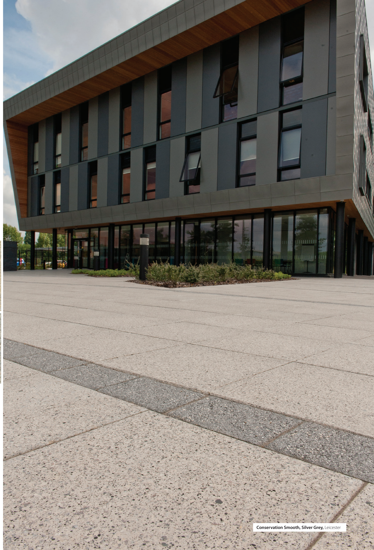
Conservation Smooth, Silver Grey, Leicester

For the latest carbon value visit www.marshalls.co.uk/commercial/carbon-calculator