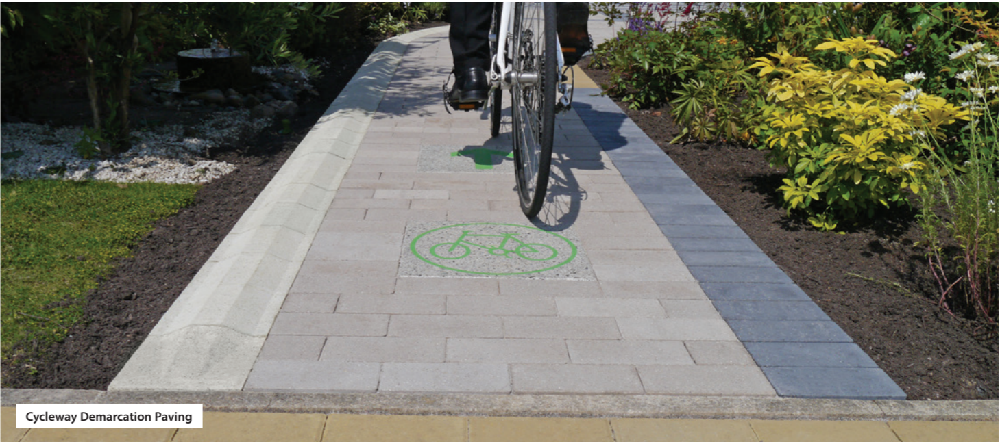
Cycleway Demarcation Paving