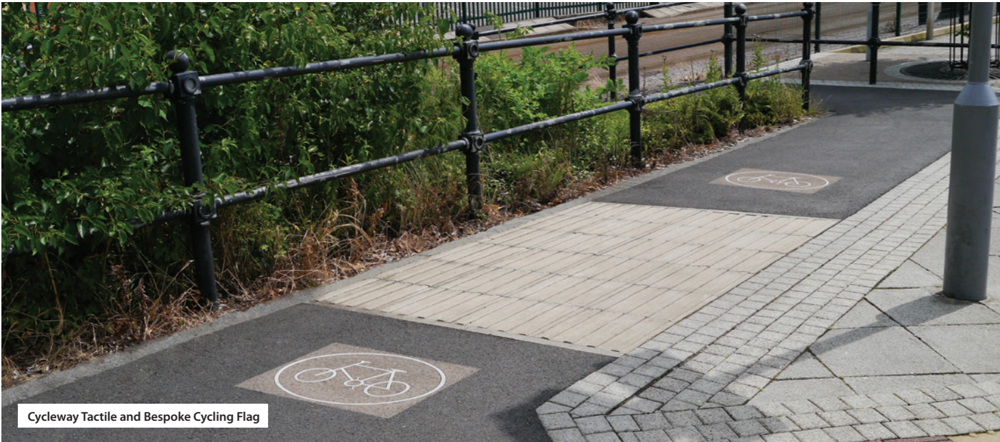
Cycleway Tactile and Bespoke Cycling Flag