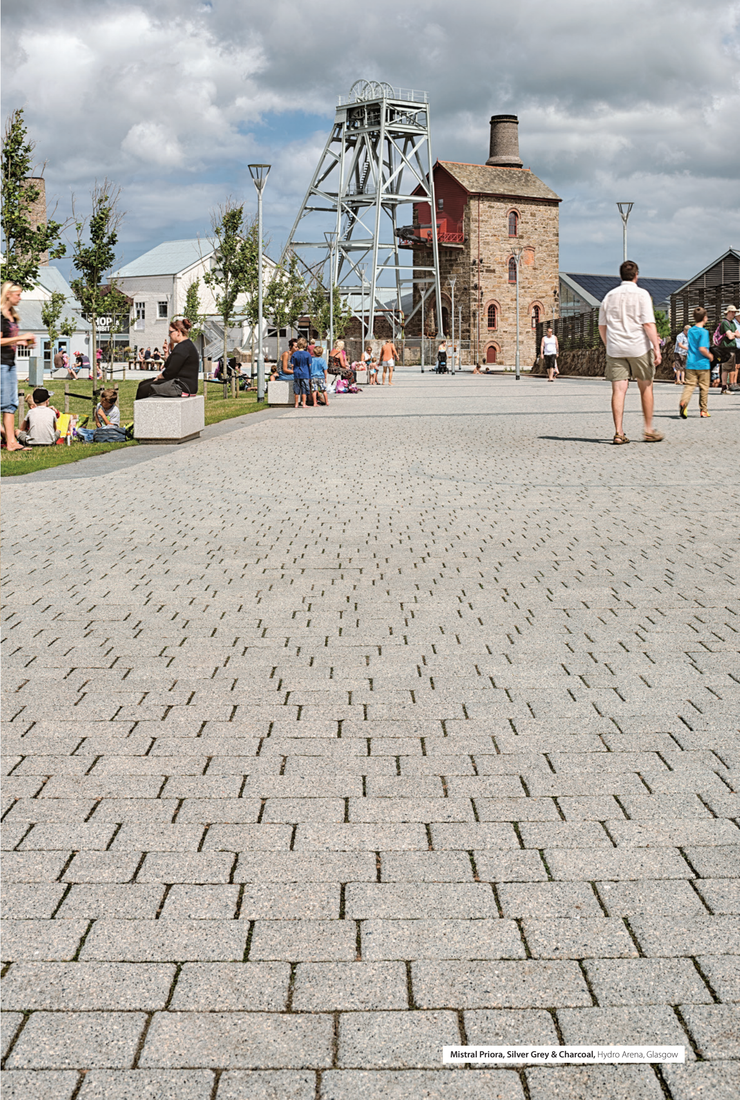
Mistral Priora, Silver Grey & Charcoal, Hydro Arena, Glasgow