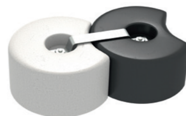
Interlocking Traffic Block to create temporary islands and junctions with no excavation cost

Traffic Blocks with reference numbers indicated in light black are manufactured to order.