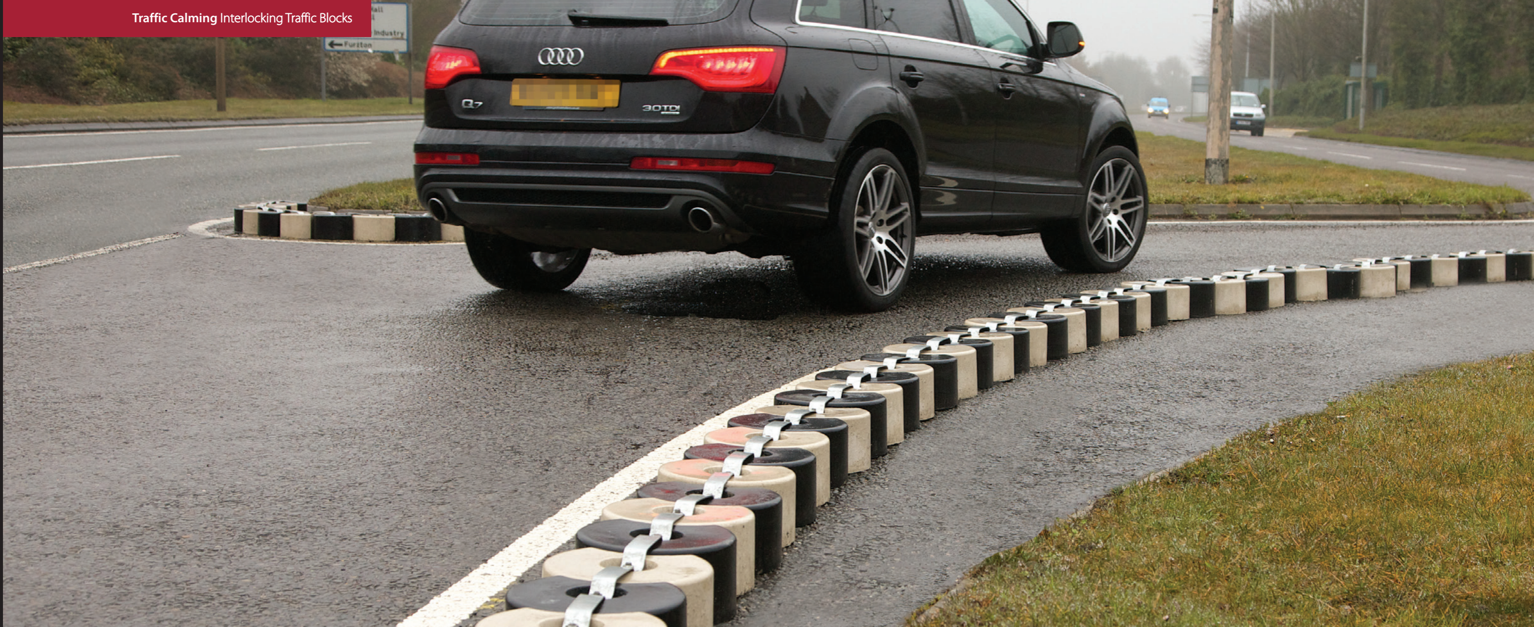
Interlocking Traffic Block, Milton Keynes