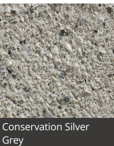
Conservation Silver Grey