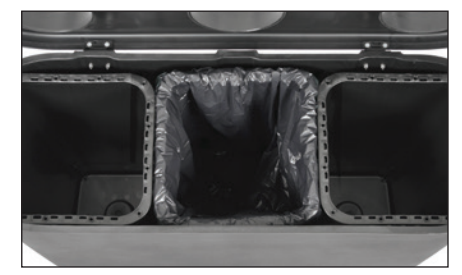
Inner container with rubbish bags