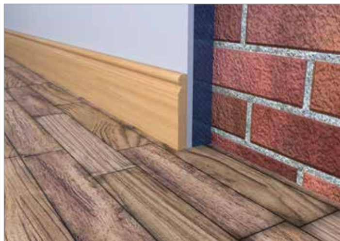
Spacetherm Wallboard skirting detail

For other thicknesses, or for U-value calculations for your project, please contact Technical Services on 01250 872261 or technical@proctorgroup.com