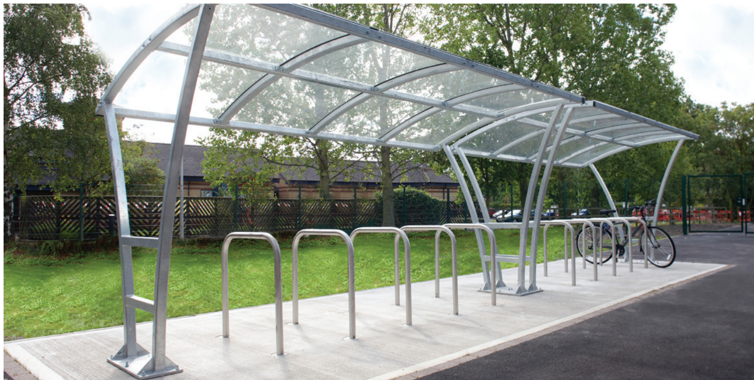
Pluto Cycle Shelter

The Pluto is an extremely functional and robust shelter. It has a design which allows it to be installed in confined spaces to allow for parking of 10-20 cycles or motor scooters. The shelter itself is flexible enough to be used as either a stand alone unit or as part of a compound.