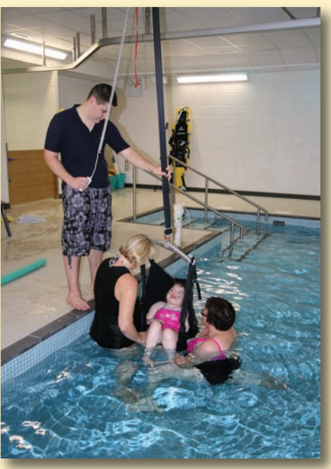
ABOVE: A mechanical hoist offers easy access, suspended from rails over the pool