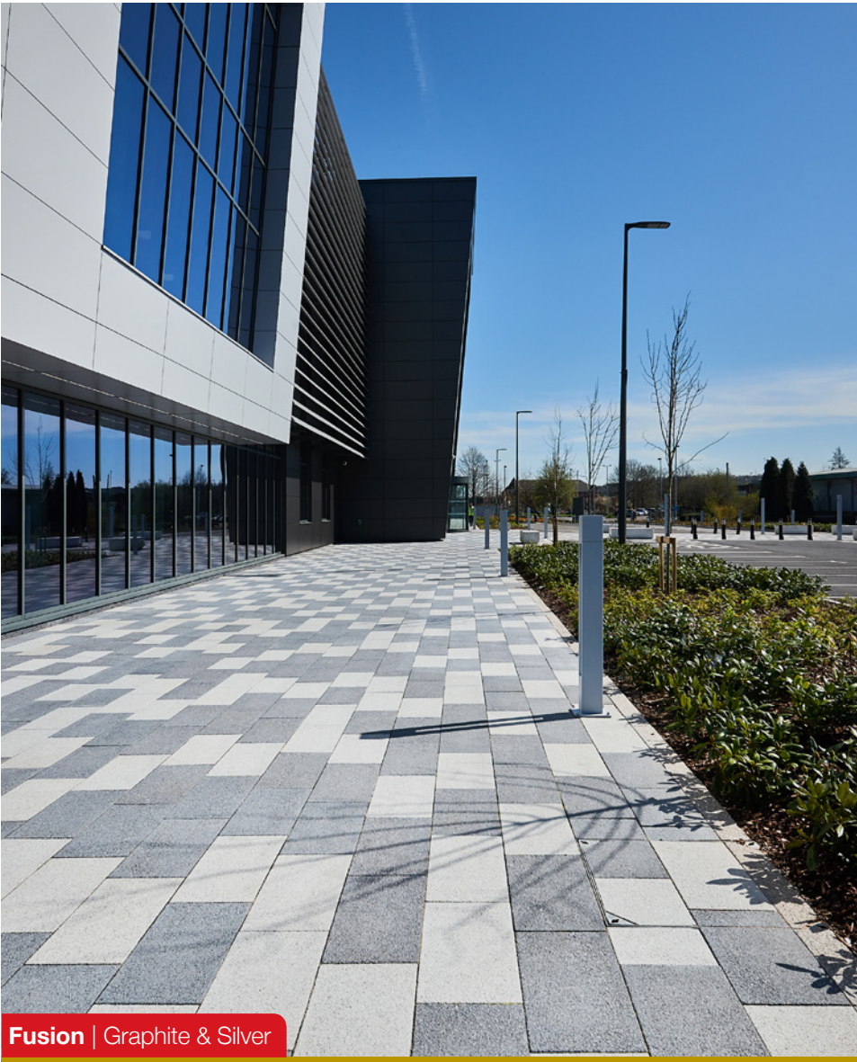
Fusion | Graphite & Silver

“We think the landscaping complements the building beautifully. The combination of Fusion paving with the Country Kerb is perfect.” Adam Allsopp | Wood Goldstraw Yorath