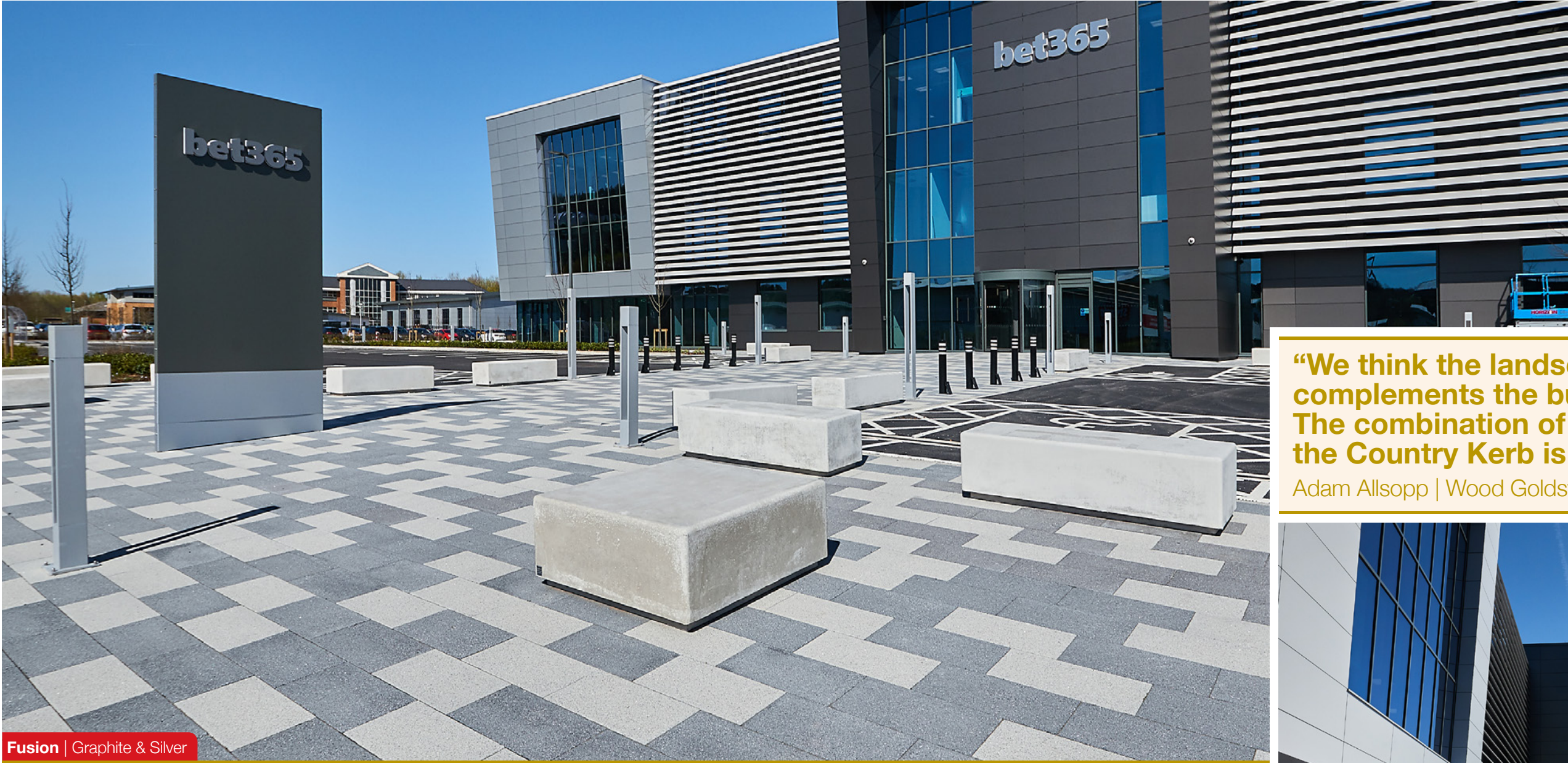
Fusion | Graphite & Silver

Architect Wood Goldstraw Yorath Main Contractor John Sisk & Son Ltd Sub-contractor Techniblock Groundworker E.P McEvilly Contractors