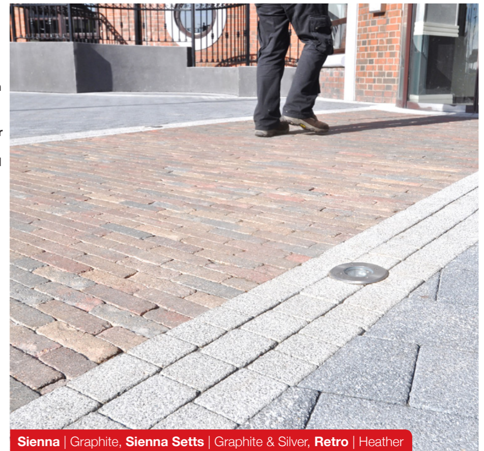
Sienna | Graphite, Sienna Setts | Graphite & Silver, Retro | Heather

The Loughshore Hotel is based around the historic Norman Castle, one of the oldest settlements in Northern Ireland, and is ideally situated for exploring some of the provinces top tourist attractions. The redevelopment works are hoped to mark a bright future for the hotel.