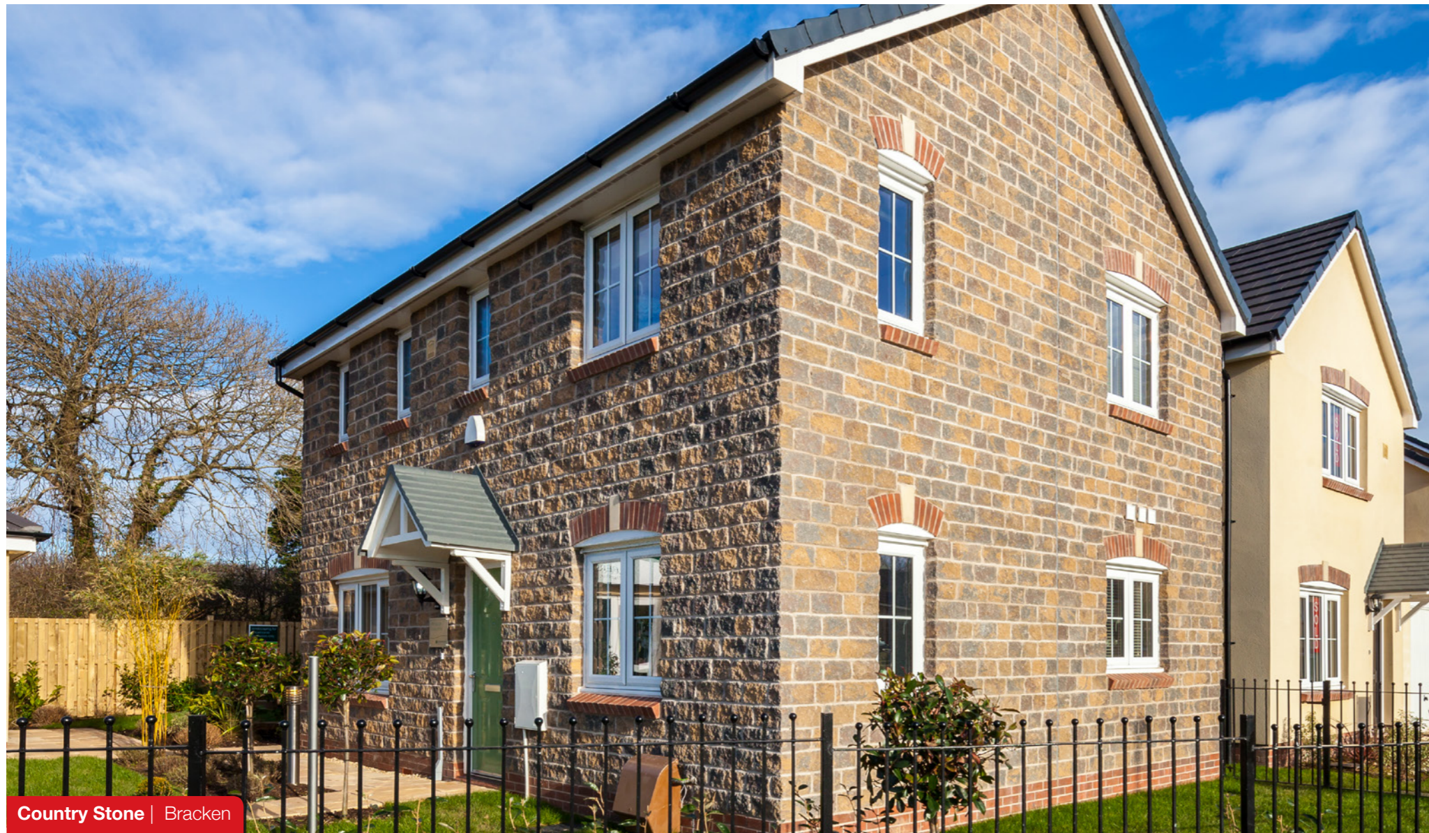
Country Stone | Bracken

Developer Persimmon Homes Architect Hammond Architectural Services Landscape Architect Tirlun Design Associates Groundworker Jones Bros