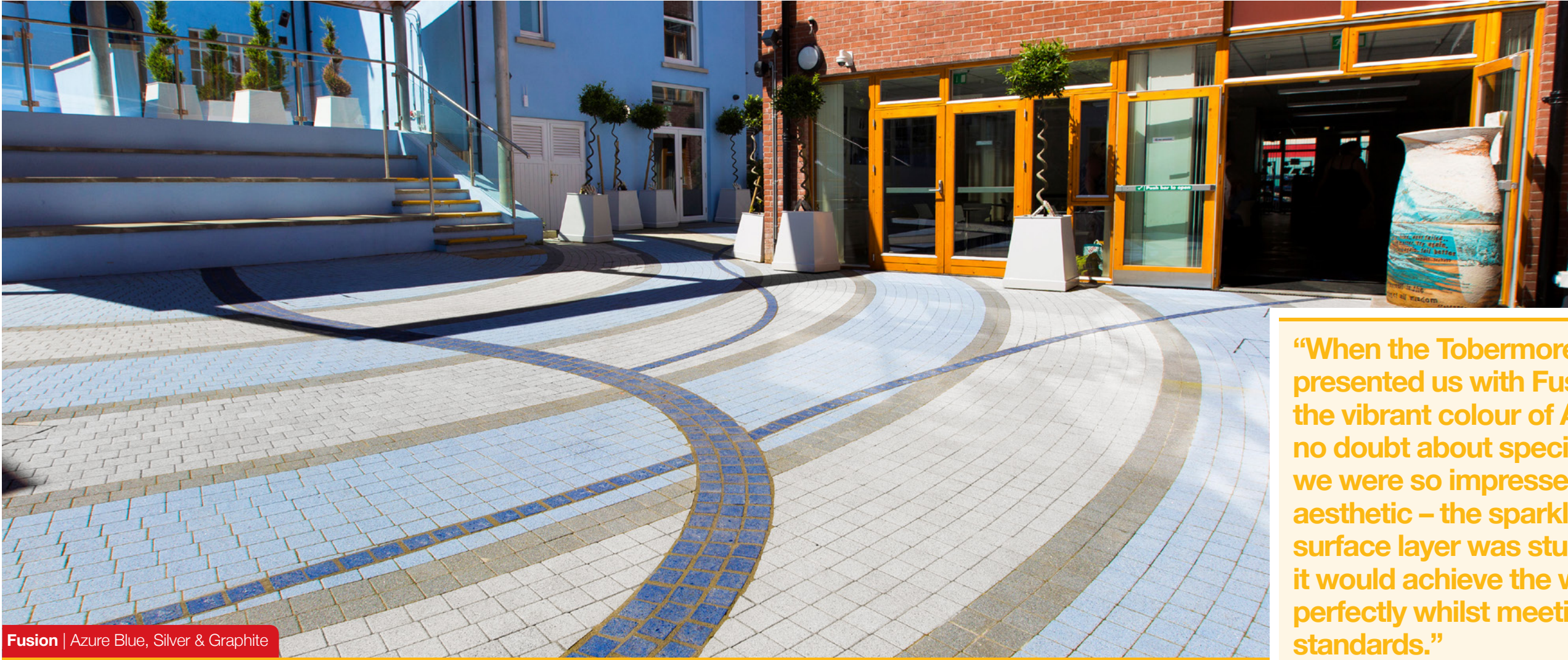
Fusion | Azure Blue, Silver & Graphite