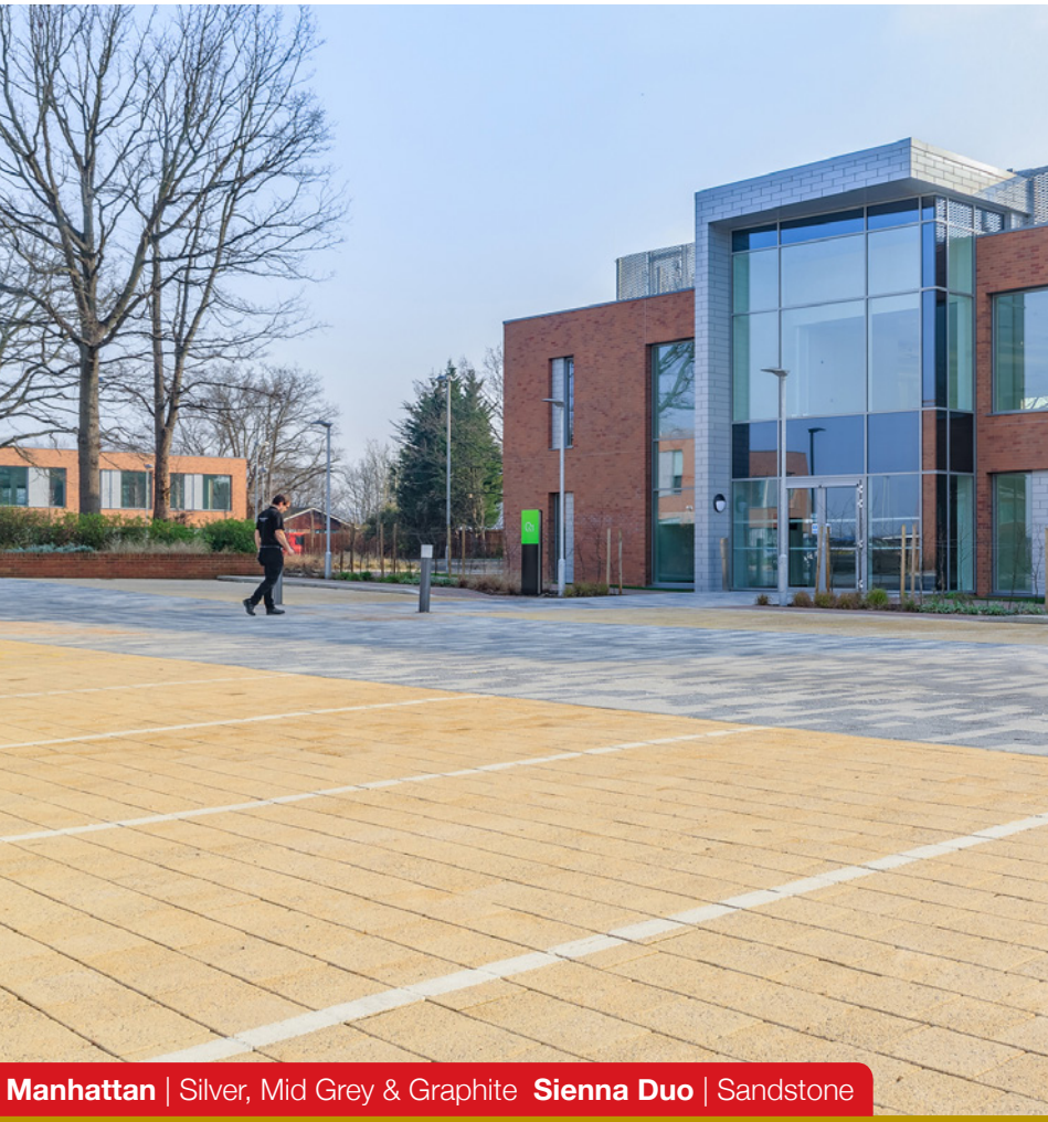
Manhattan | Silver, Mid Grey & Graphite Sienna Duo | Sandstone