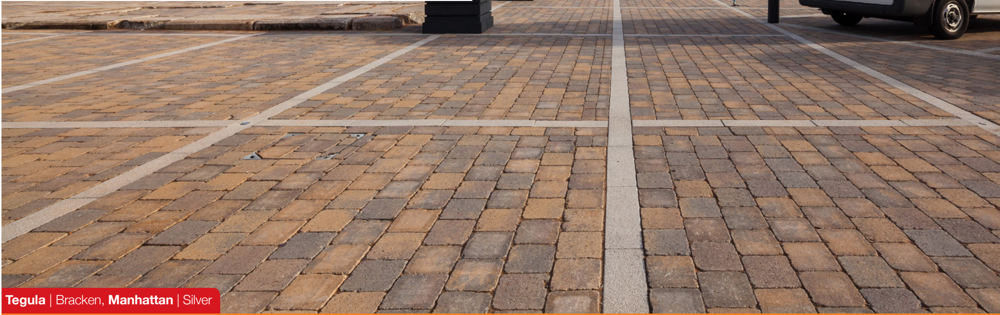
Tegula | Bracken, Manhattan | Silver

Products Used: Tegula | Bracken Manhattan | Silver