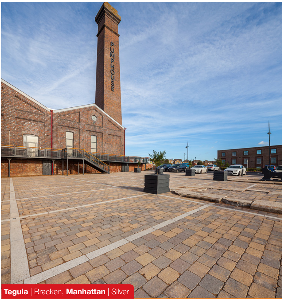
Tegula | Bracken, Manhattan | Silver