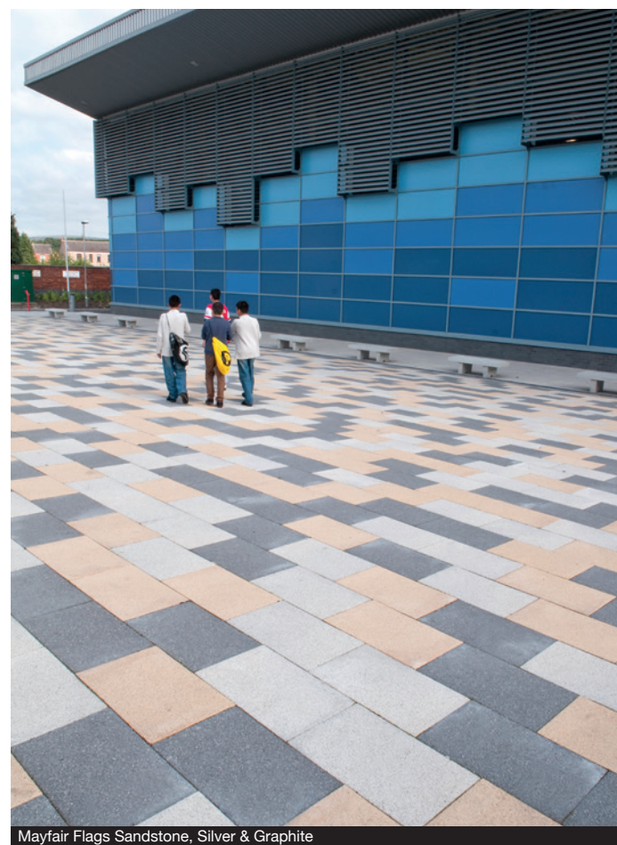
Mayfair Flags Sandstone, Silver & Graphite