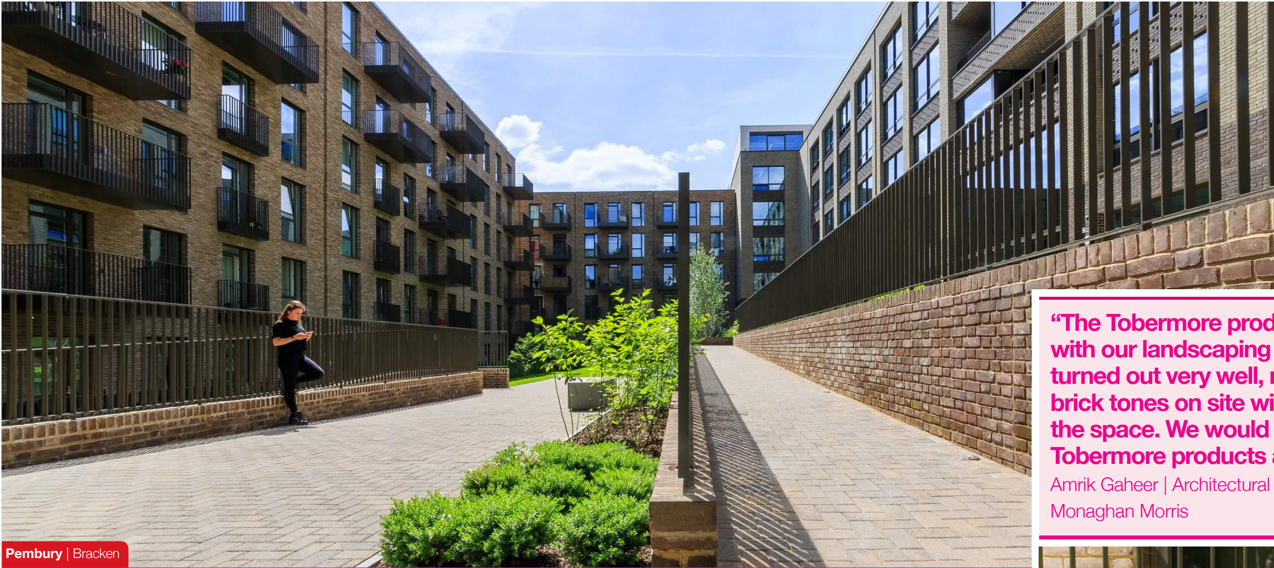
Pembury | Bracken