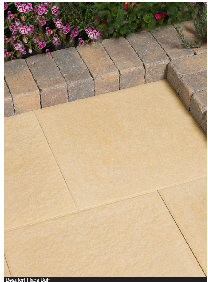
Beaufort Flags Buff