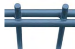
Twin horizontal wire construction