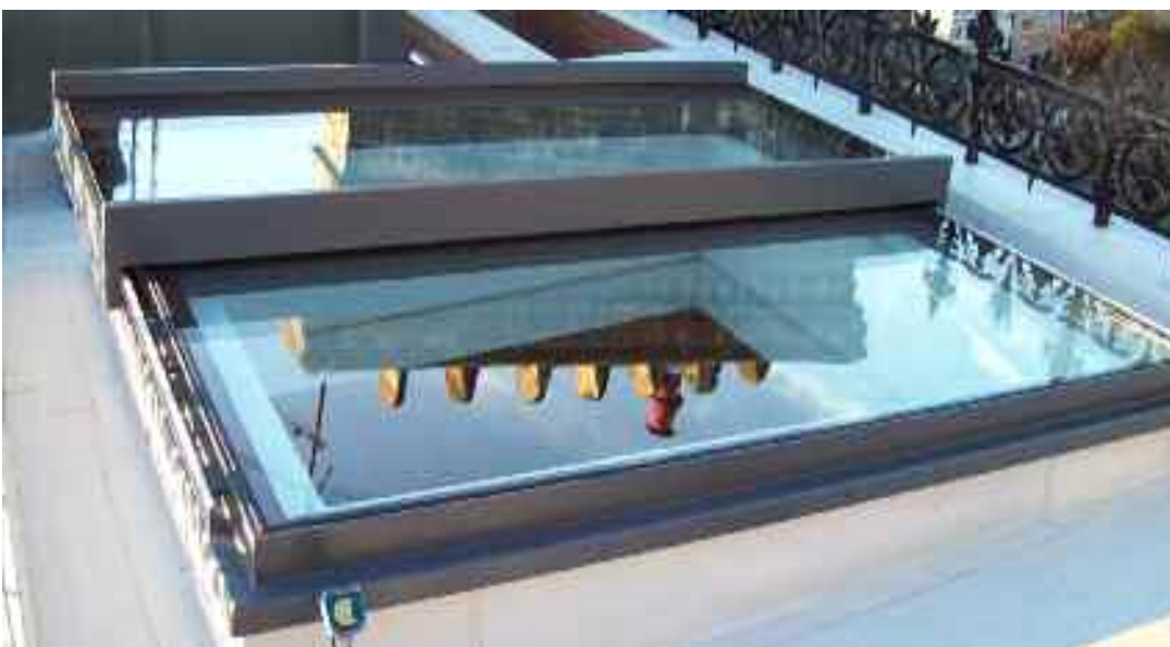
GV Standard Sliding Over Roof