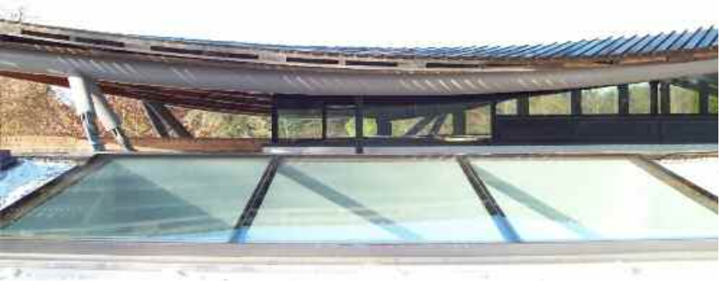
Multipart Flushglaze at Savill Gardens Visitors Centre

The Flushglaze Modular Rooflight system has been developed to cater for joining rooflights together to create large expanses of glazing; it has also been developed to cater for more complex scenarios such as (The Ridglaze and Eaves Flushglaze Rooflights). The Flushglaze rooflight has an extremely low profile system which is based on car windscreen technology, the glass being structurally bonded and triple sealed making it an ideal rooflight for flat roof applications on a pitch of only 3-5 degrees also for pitched roofs up to 70 degrees.