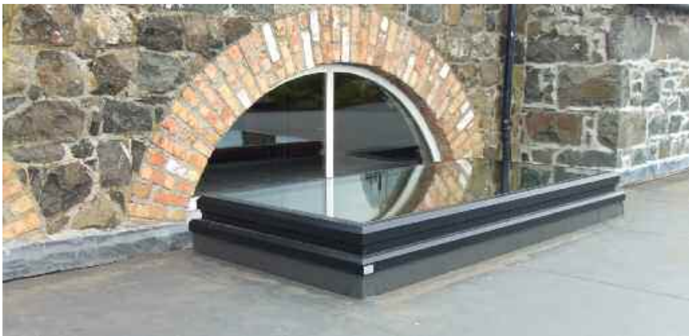
Closed VisionVent in Dublin

The VisionVent is a thermally broken hinged flat roof vent, the VisionVent can be installed on a flat (Minimum 3 degrees) or pitched roof, or even incorporated into our Flushglaze rooflight for large areas of glazing where there is a requirement for ventilation. The product has been designed with a minimal amount of visible internal framework and concealment of the electrical operators within the frame, giving a 100% clear glass area.