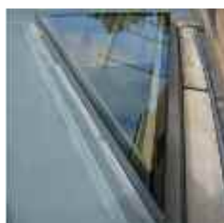
Pictures from left to right Bespoke triangular flushglaze, ridgeglaze, Flushglaze incorporating PV cells