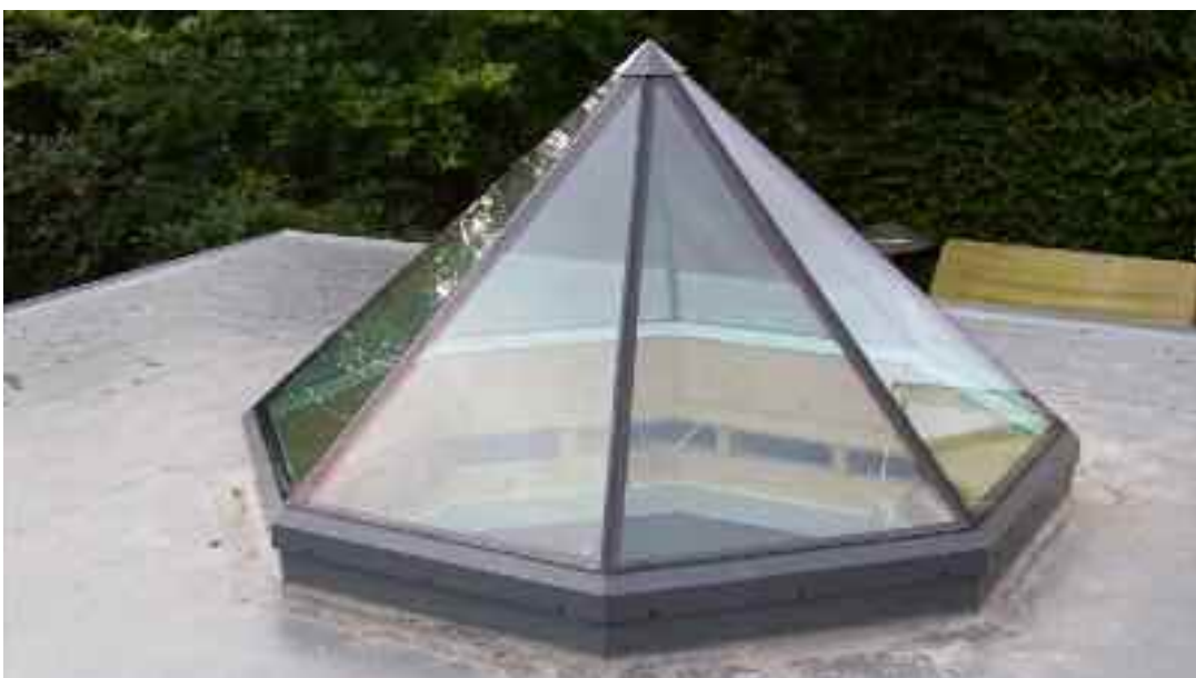
Electric Hinged Pyramid