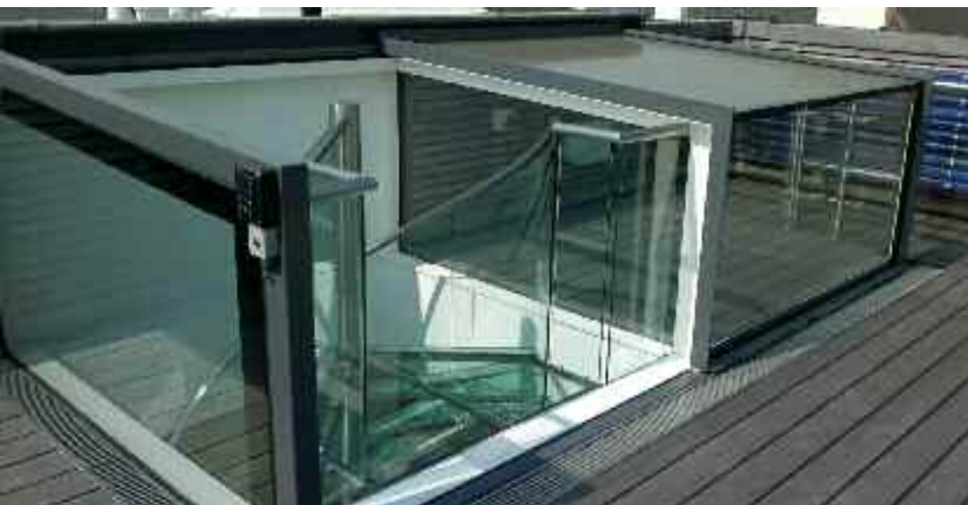
GV Standard Free Standard Box Rooflight

Glass spec 28mm DGU: 6mm Toughened Outer 16mm Argon filled warm edge spacer bar 6mm toughened Low E inner