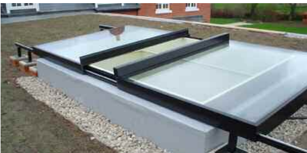
Bespoke Sliding Stacking Rooflight

Bi parting rooflights have been manufactured in many different variations, sliding over fixed and sliding over roof configurations