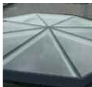
Pictures from left to right: Bespoke Octagonal, Internal Downlighter and Large Bespoke framed Pyramid