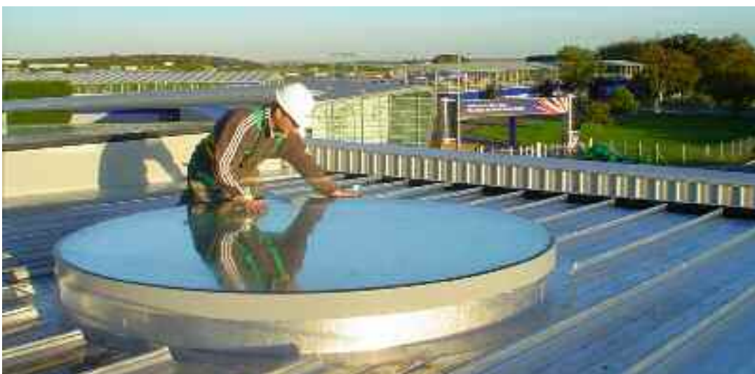
Walk on Flushglaze