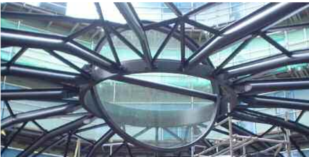
Bespoke Sliding Ridge Rooflight

And for when there has never been anything like it done before, we will just design it from scratch!