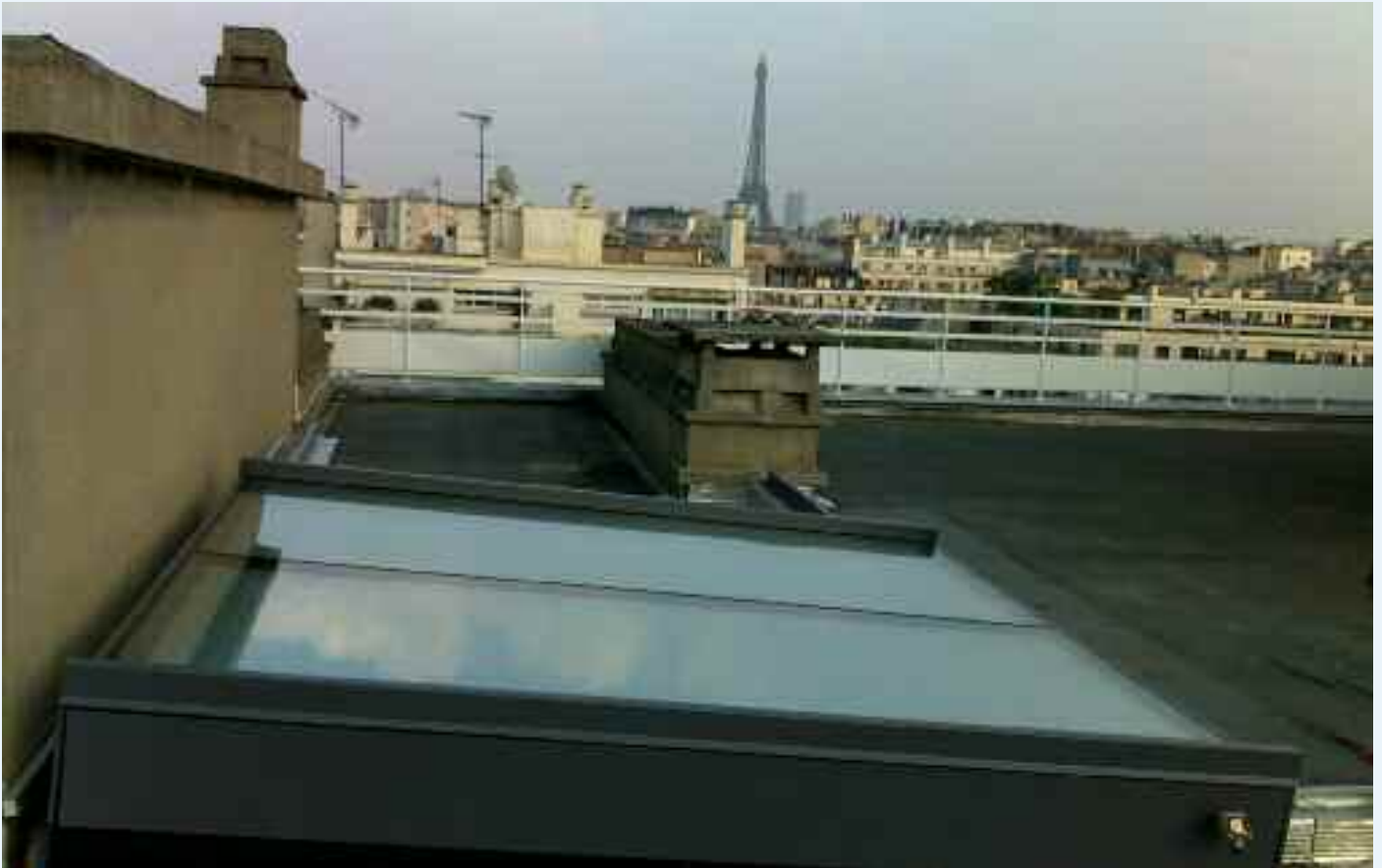
Bespoke Sliding over roof rooflight in Paris