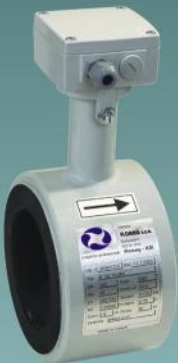
Wafer Remote Sensor