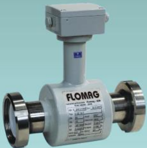
Remote Sensor with Sanitary Fittings (DIN11851)