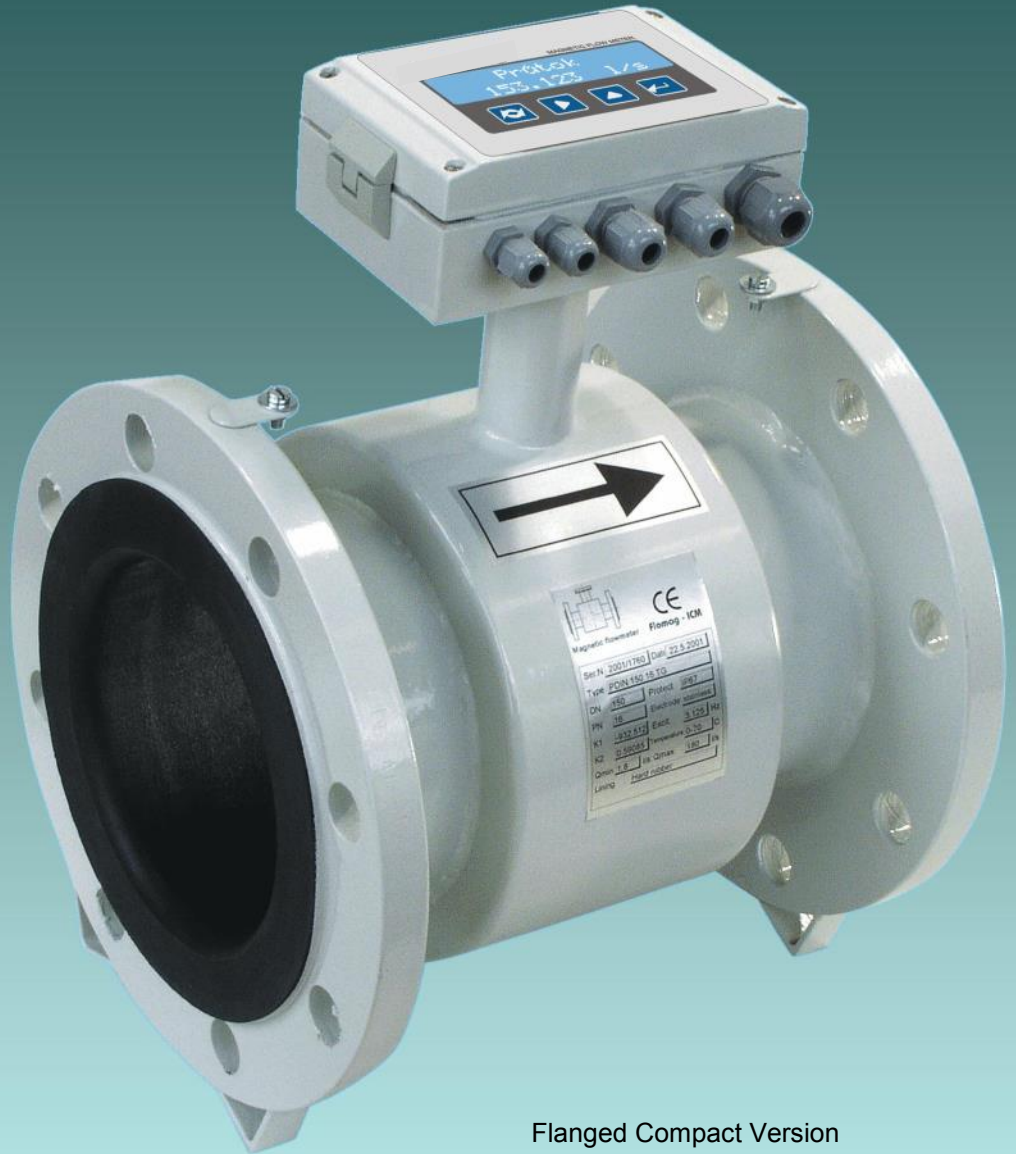
Flanged Compact Version

Smart Storm Limited The Old Mill Wainstalls Halifax West Yorkshire HX2 7TJ, UK Tel:+44 (0)1422 363 462 E:sales@smartstorm.eu