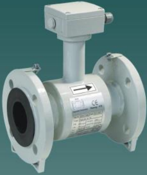
Flanged Remote Sensor