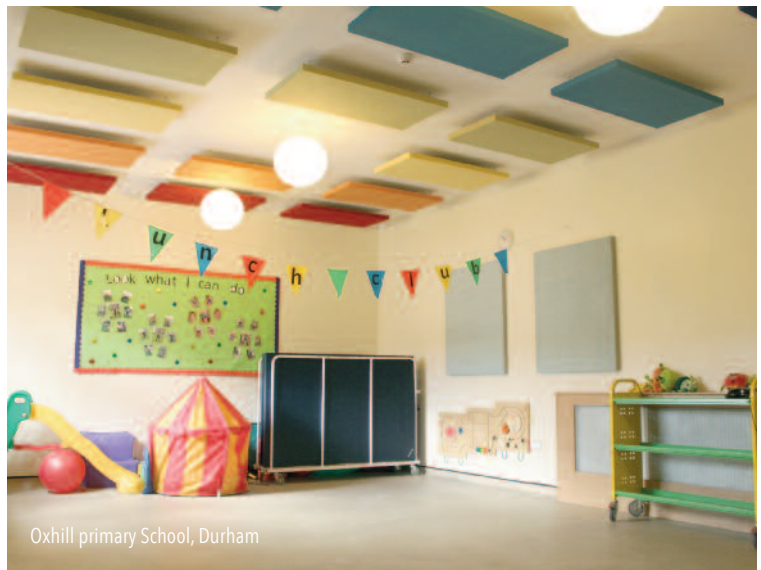
Oxhill primary School, Durham