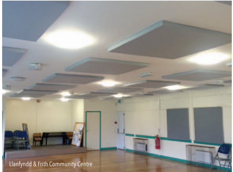
Llanfynydd & Frith Community Centre

General Feedback LLANFYND & FRITH COMMUNITY CENTRE