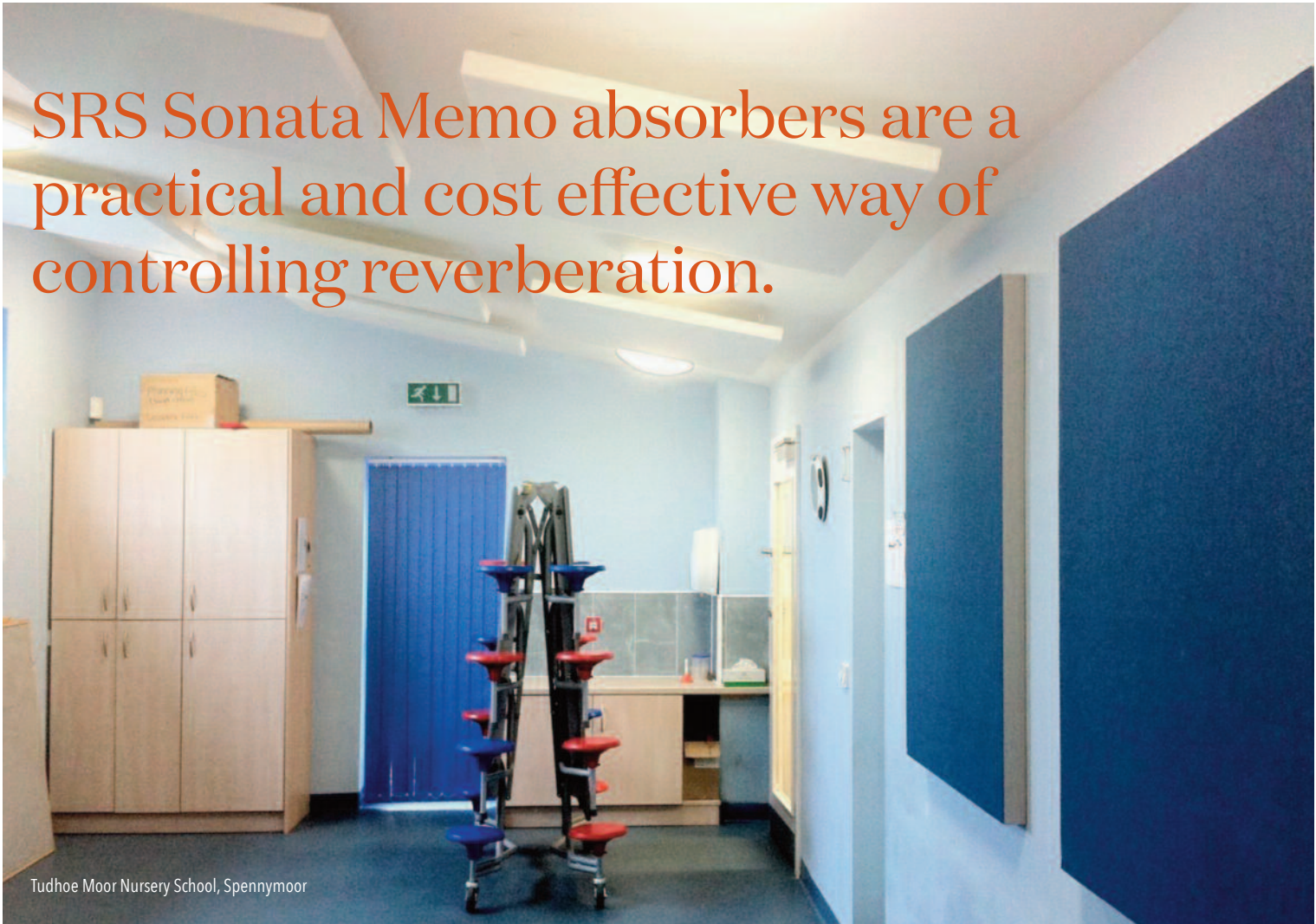
Tudhoe Moor Nursery School, Spennymoor

SRS Sonata Memo absorbers are a practical and cost effective way of controlling reverberation.