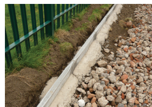
Edging kerbs installed