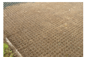
Cells filled with a soil rootzone mix