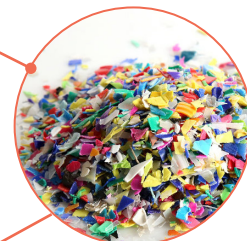
Recycled Plastic Flakes