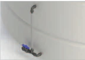
Bund Sight Gauge