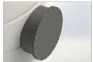
620mm Side Access Manway