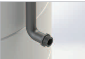
Male BSP Adapter Nipple