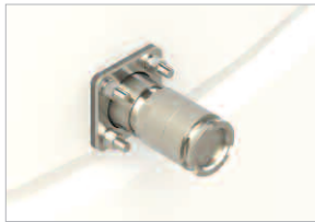
Tanker Fill Point