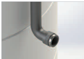
Female BSP Adapter