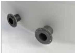
PN 16 Flange