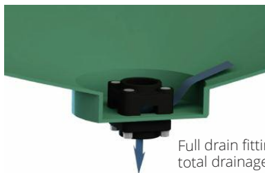
Full drain fitting for total drainage