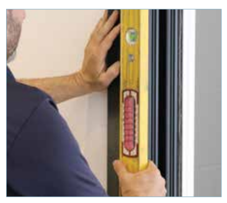
FIG 5 FIG 6