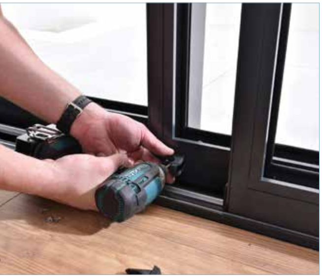
FIG 12 FIG 13