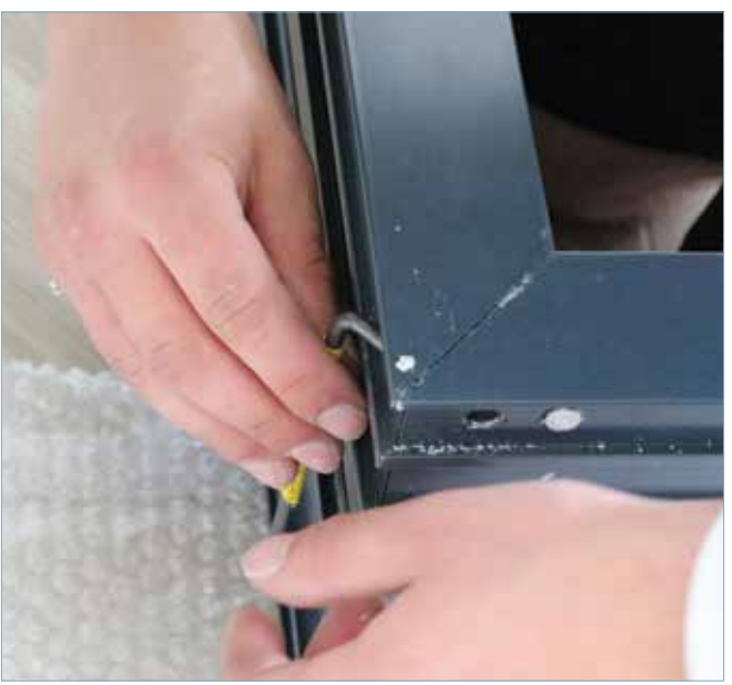
FIG 2 FIG 3