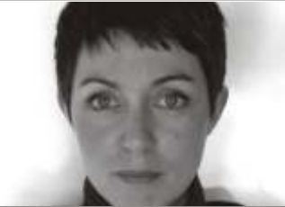
Designer: Lucile Souflet (BE)