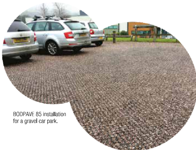
BODPAVE 85 installation for a gravel car park.