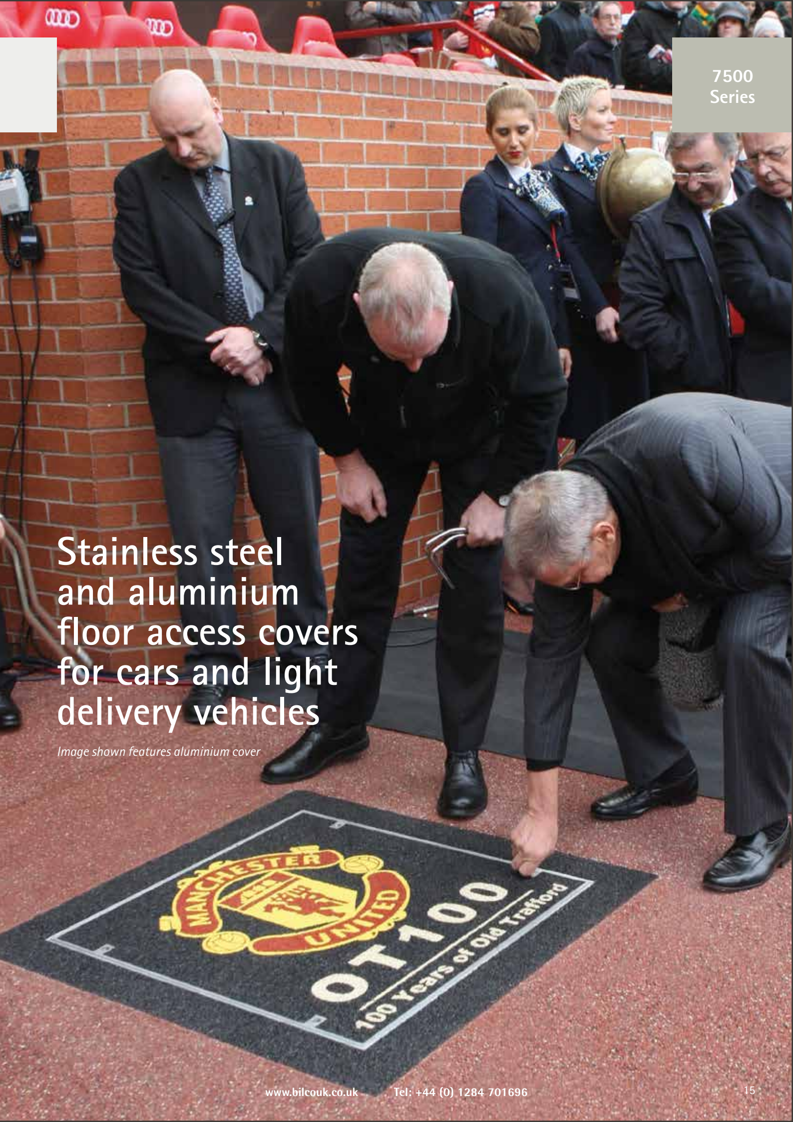
Image shown features aluminium cover