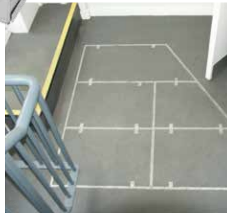
Aluminium Multipart covers