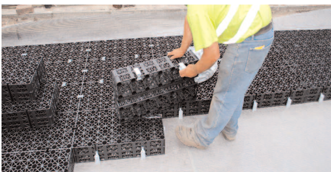
7. ArborRaft units simply lock together with connectors.