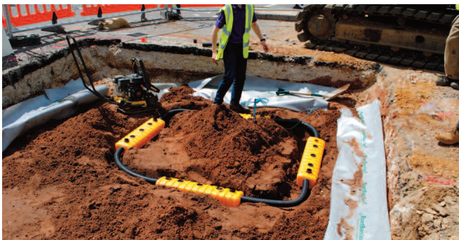
5. Install irrigation system.