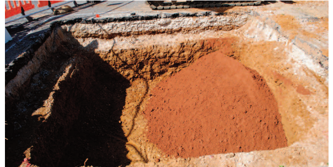
2. Backfill lower pit with approved subsoil, position tree or leave vacant for planting season.