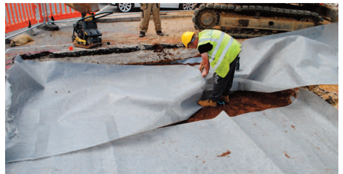
6. Cover with ArborRaft TRC30 Membrane.