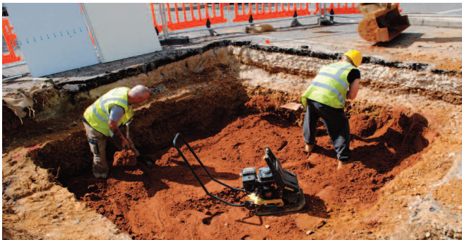
3. Compact subsoil to architects specification