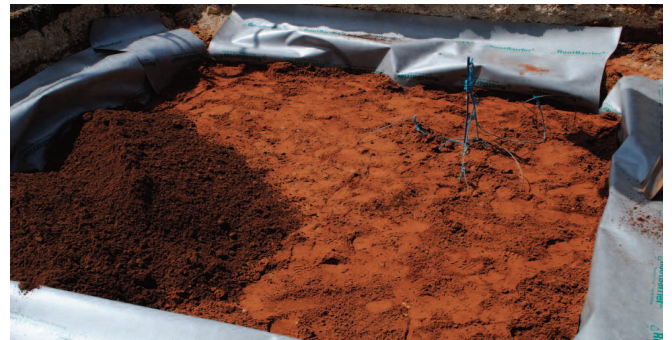
4. Add ArborRaft soil to top approx. 400mm of tree pit.