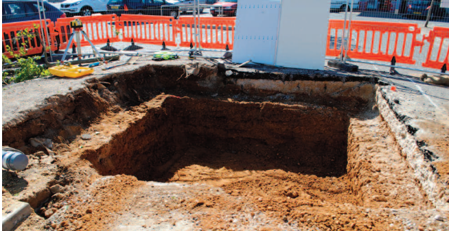
1. Excavate tree pit to include 500mm supporting shelf at the top of the tree pit.