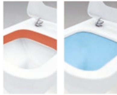
With traditional box-rimmed toilets, approximately 20% of the bowl is unwashed.

With AquaBlade® technology, the optimised water pressure and smooth curves of the bowl flush bacteria clean away with no unhygienic splashing. The bowls are also very easy to clean, with no overhanging rim to hide potentially dirty areas.